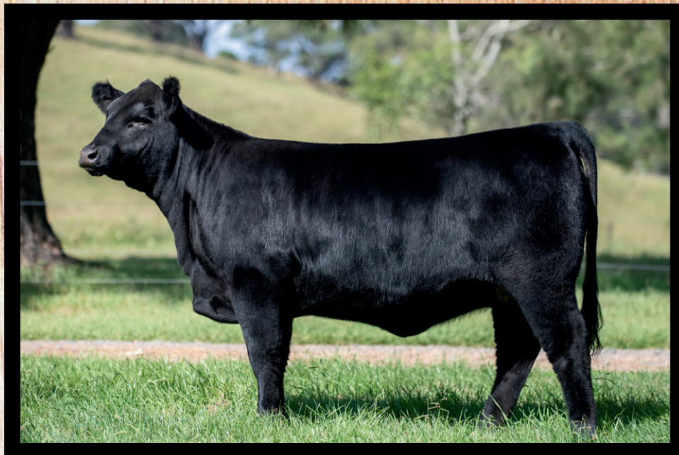
Pictured: Ashgrove Beeac U11 (daughter)