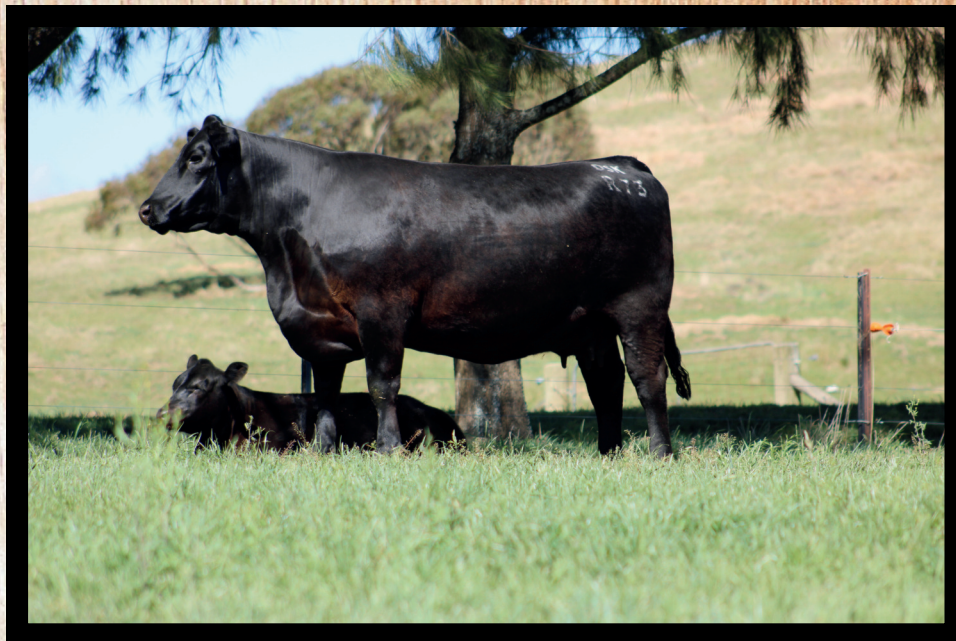
Pictured: DSK Tel Lady Heather R73