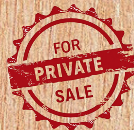
Pictured: Hillview Silkwood S100 (Dam)