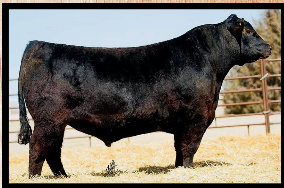
Pictured: Poss Deadwood