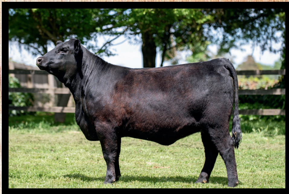
Pictured: Ashgrove Martina U14