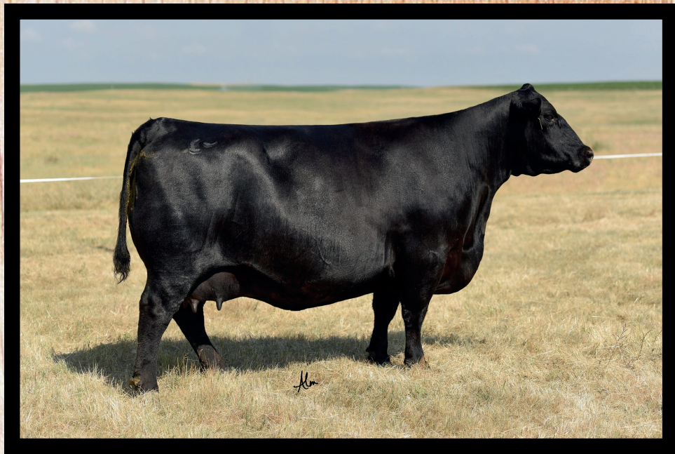
Pictured: Baldrige Isabel Y69