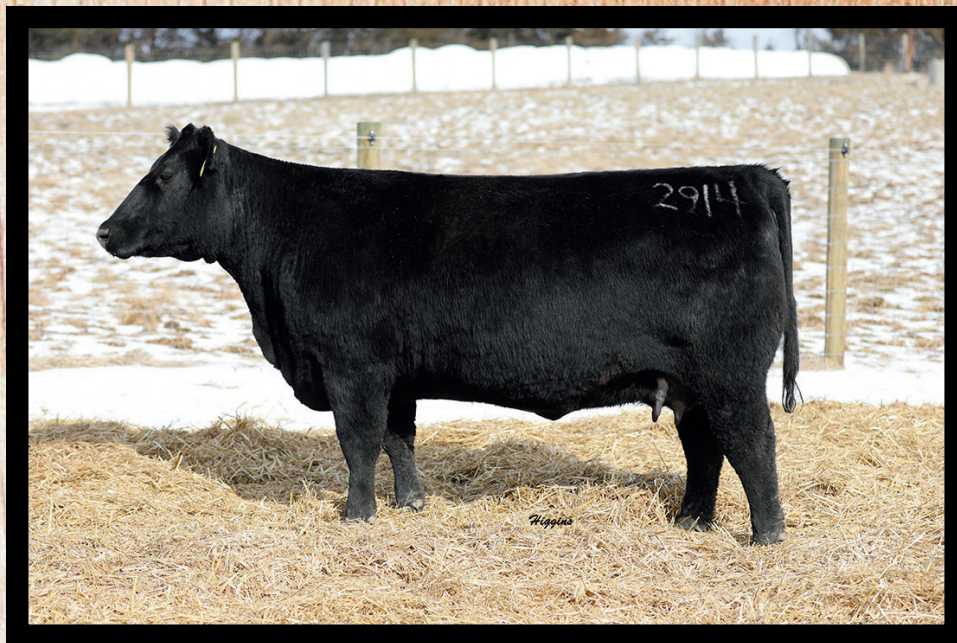
Pictured: G A R Sure Fire 2914