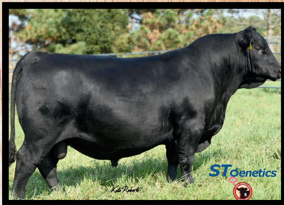
Pictured: Poss Winchester