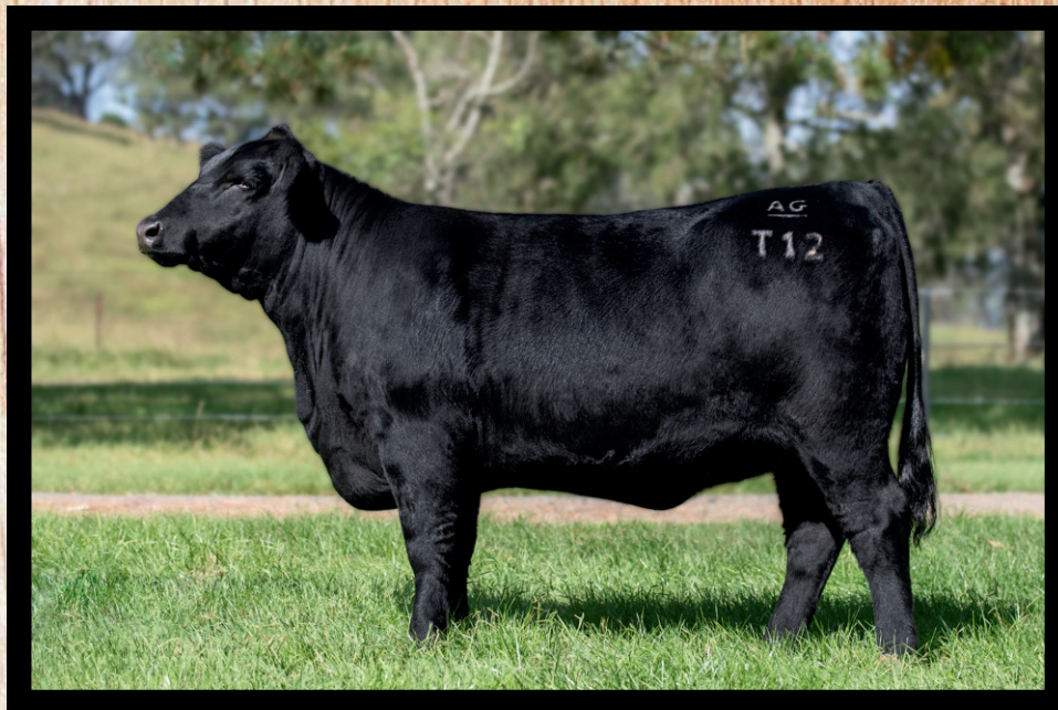
Pictured: Ashgrove Toque T12