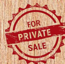
Pictured: Ashgrove Beeac U11